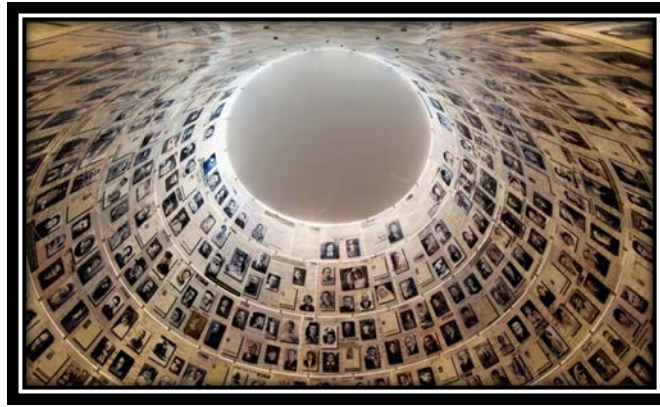
Hall of Names, Yad Vashem